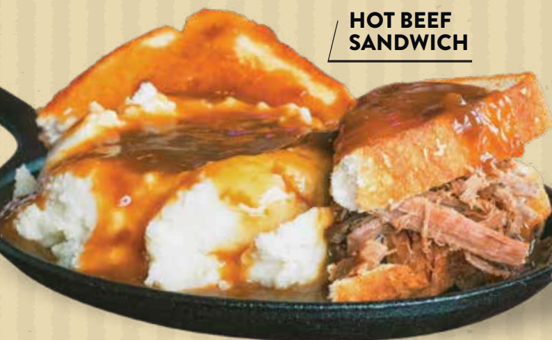
HOT BEEF SANDWICH